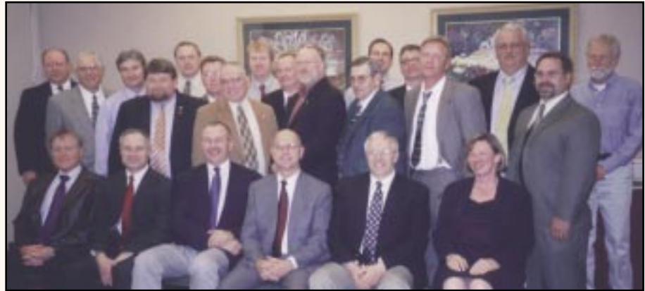
ICCA Board members and guests at the spring meeting, Washington, DC.

Following the briefing, board members called on their own legislators to familiarize them with the CCA program and to leave contact information for future reference. This was the first opportunity many board members had to make Hill visits and they are looking forward to expanding the event in February 2006. It is expected that the next farm bill will be in the process of development at that time and there will be plenty for ICCA Board members to talk to legislators about.